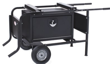
60506 - Cart W/O Toolbox